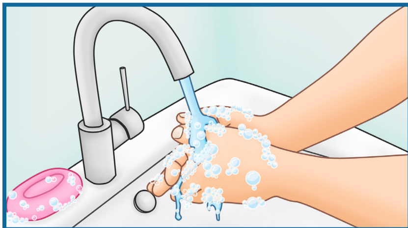
Wash your hands.