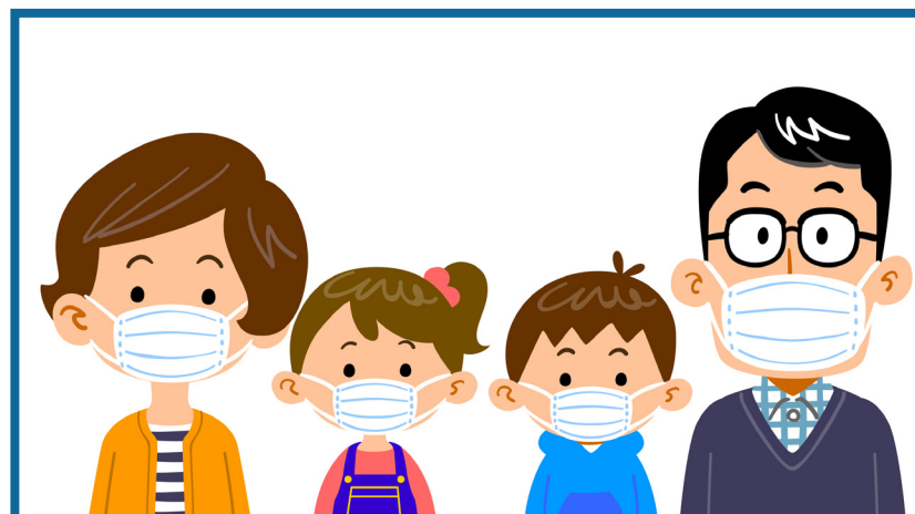
Wear a mask.